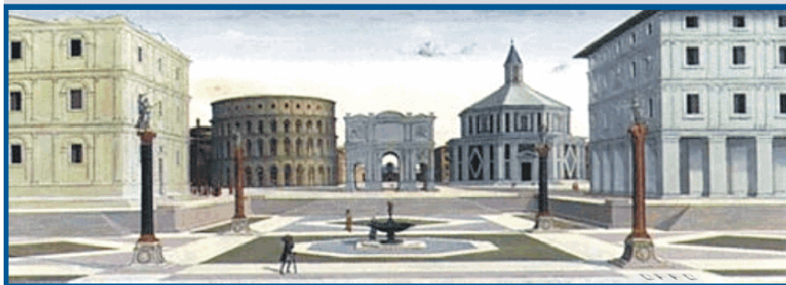
La Città Nuova